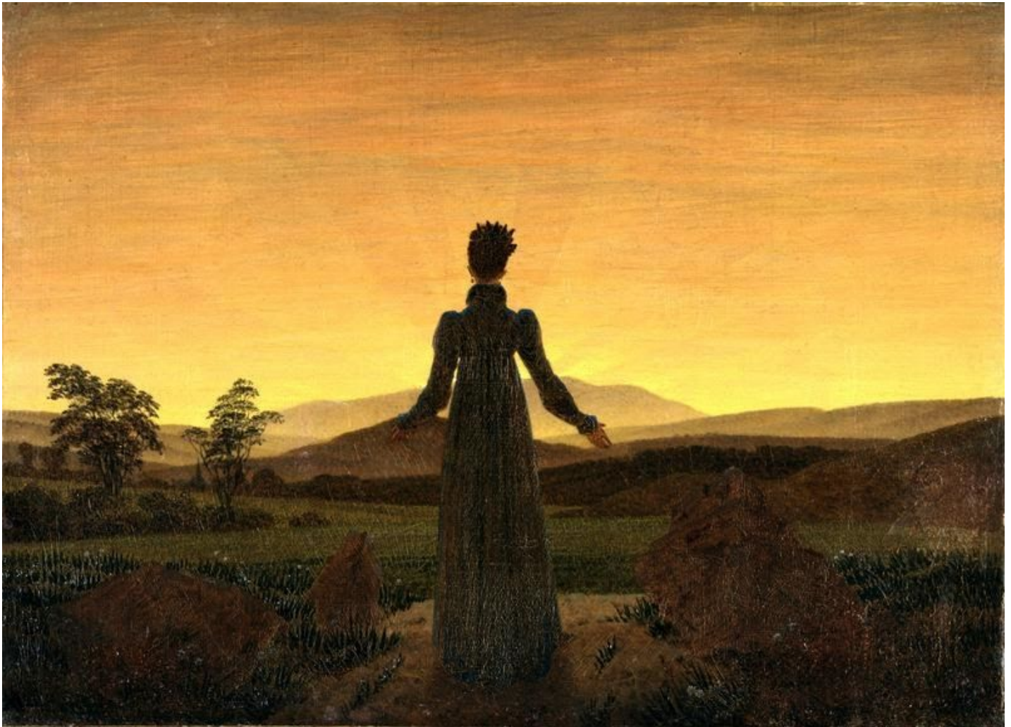
Friedrich, Caspar David, 1774-1840. Woman before the Rising Sun (Woman before the Setting Sun)

October 18, 2020 Warner Memorial Presbyterian Church 10123 Connecticut Avenue, Kensington, MD 20895 301-949-2900 phone • 301-933-7704 fax www.warnermemorial.org , office@warnermemorial.org